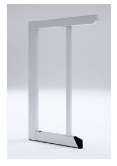
Retro fit front support leg for exceptional loads.