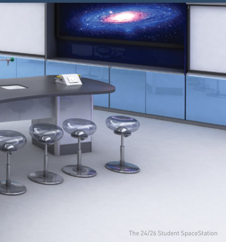
The 24/26 Student SpaceStation

SpaceStation provides safe, comfortable seating positions for students and renders perimeter benching spare capacity which can then be dedicated to storage because it is not needed for practical work. The generous work surface space per student, excellent circulation space and fully serviced worktops are equally well suited to dedicated biology, chemistry, physics and accordingly for integrated science.