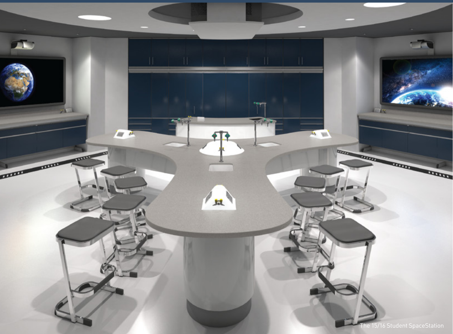
The 15/16 Student SpaceStation