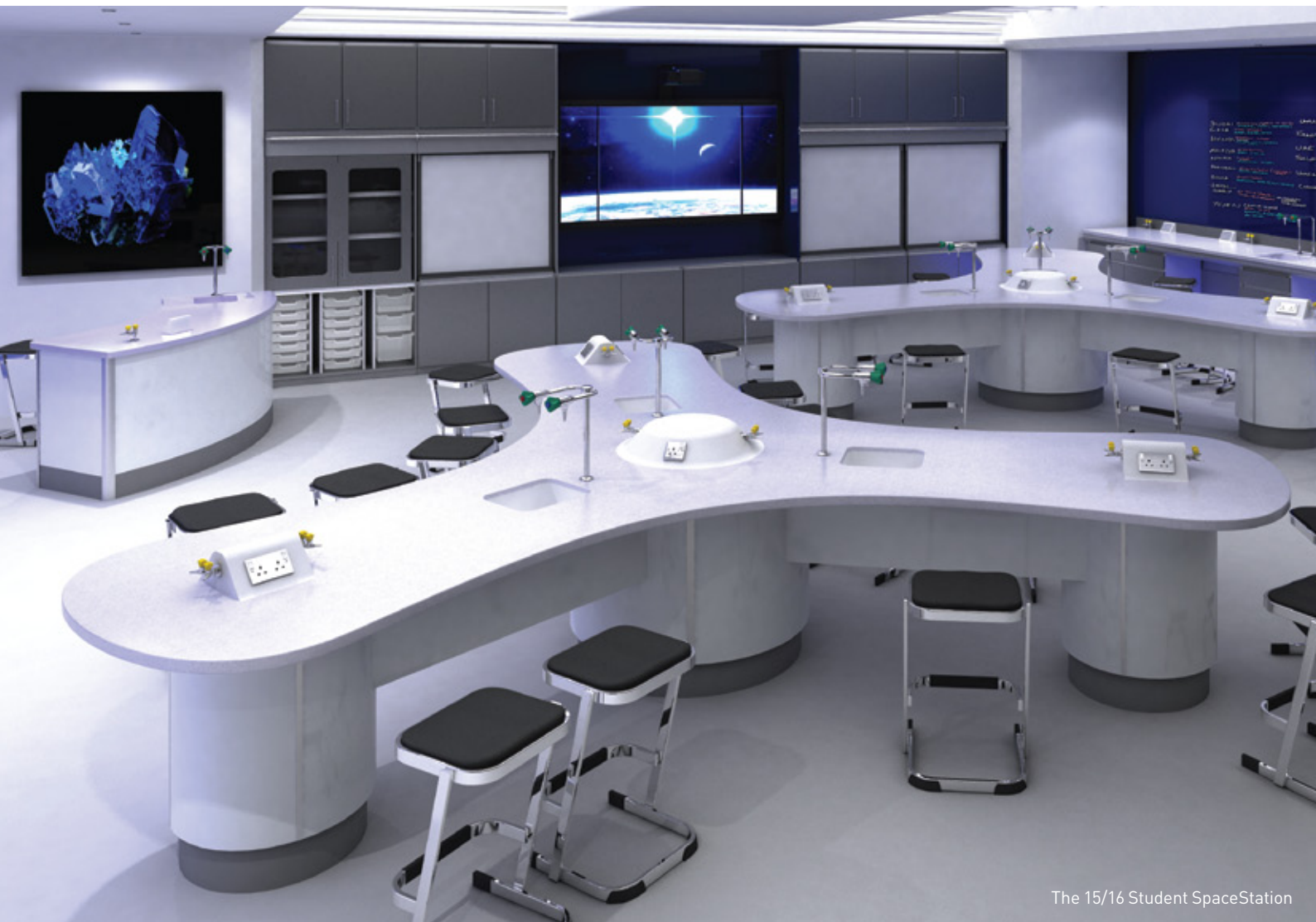
The 15/16 Student SpaceStation

S+B has been at the forefront in researching and developing new, innovative and compelling specialist science furniture systems for several decades. The introduction of SpaceStation is the latest affirmation of our ongoing commitment to providing exciting and inspirational science learning spaces.