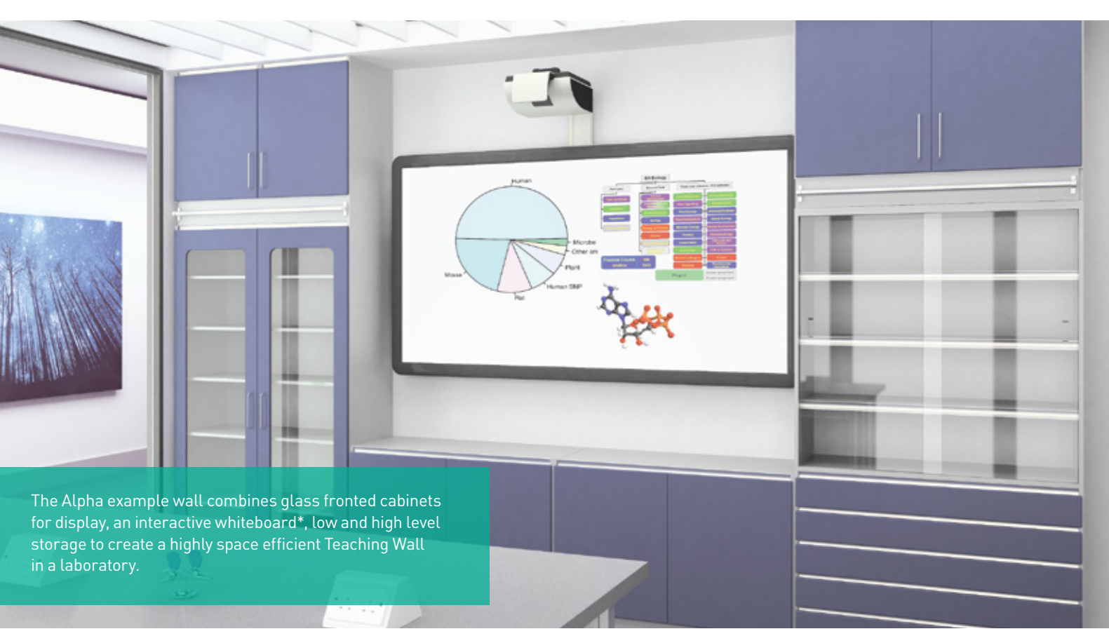
*Although we can supply interactive whiteboards as part of the assembly, many of our clients prefer to source the supply and installation of this item directly in order to prevent any warranty validation issues.

To illustrate our new range of storage furniture our design team have compiled 5 example renderings to show some possible uses. The Spacesaver assembly has endless configurations that would be suitable as a teaching wall with whiteboards for school and university or as a highly space efficient resource base for any research or working environment.